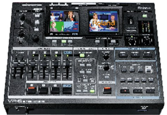
AV Switcher and Recorder